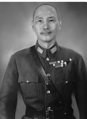
▲ Jiang Jieshi and the Nationalist forces united China under one government in 1928.

The Long March In 1933, Jiang gathered an army of at least 700,000 men. Jiang's army then surrounded the Communists' mountain stronghold. Outnumbered, the